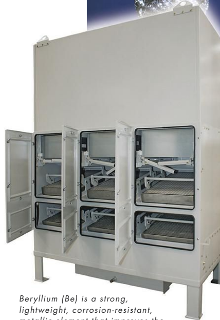
Beryllium (Be) is a strong, lightweight, corrosion-resistant, metallic element that improves the physical properties of many materials when added as an alloy. A mist collector with a source capture collection system, such as the one shown here, is the best solution for operations that use metalworking fluids where beryllium is present.

OSHA requires employers to use engineering controls in areas that have high and low exposure to airborne beryllium. These controls include wet methods and/or ventilation to capture airborne beryllium and keep worker exposure below the new PELs. Along with providing respiratory equipment and personal protective clothing when neces-