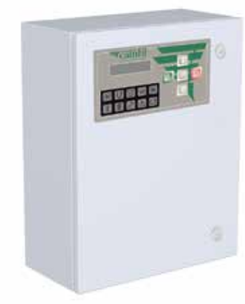
ATEX 3 D approved integrated controller. The controller operates the complete system including the optional Dual Valve system. Control through potential free contacts and/or MODBUS.