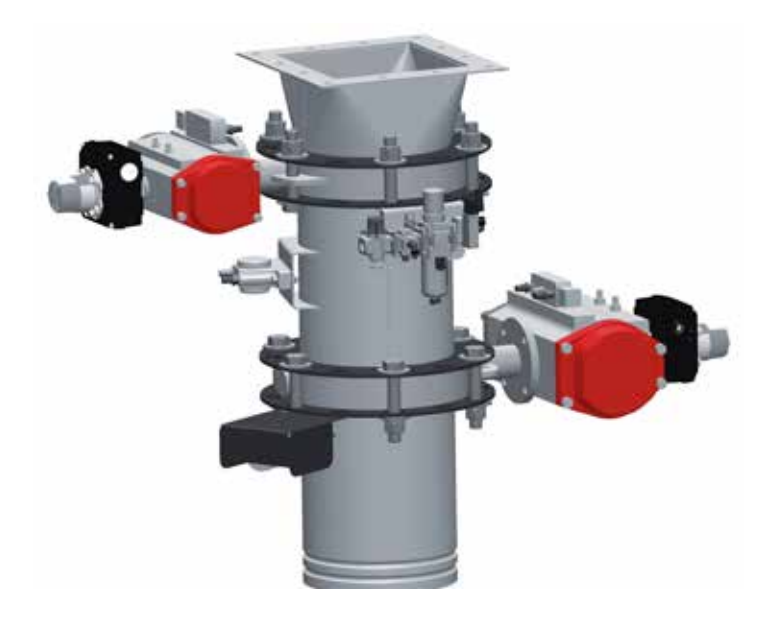
QPP2 Dual Valve compatible