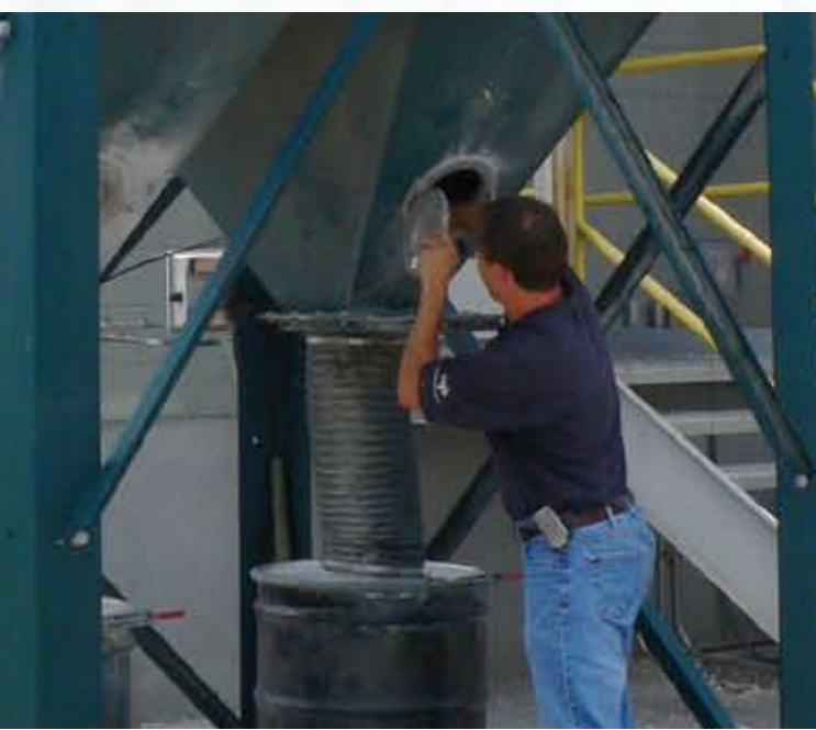
Optional Quick Open View Port in Hopper

Gold Cone™ Cartridge with patented Cambar action that positively seals the cartridges without using threads or knobs.