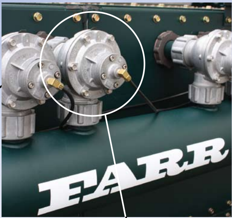
Powerful Cleaning System to Provide Long Filter Life