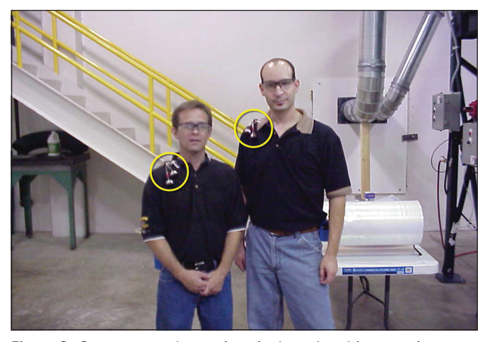
Figure 3. Operators each wearing single and multi-event air sampling pumps and filters (indicated by yellow circles) before the liner change operation.

four filter change tasks of the operational test. Figure 3 shows the operators each wearing single and multi-event air sampling pumps and filters.