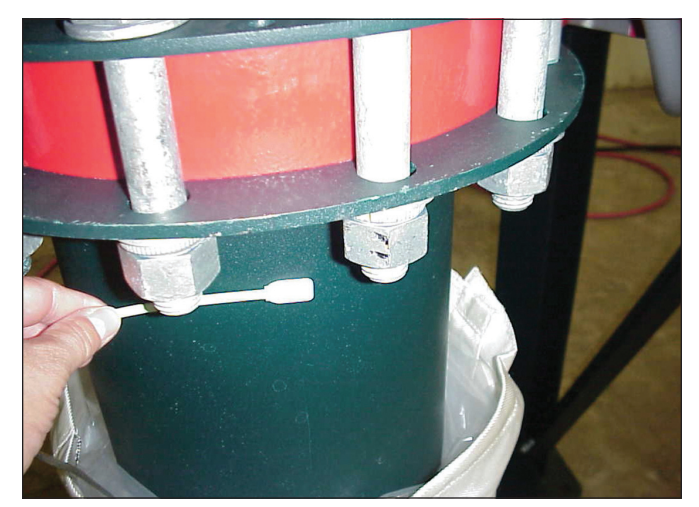
Figure 6. Location of swab sample collected from discharge chute after completion of continuous liner discharge No. 3.

These samples were collected after the cleaning of the test location. They were collected in specific areas both in the testing room and on the equipment. The purpose was to determine the validity of the air and swab samples collected during the surrogate test. If the background sample results showed a