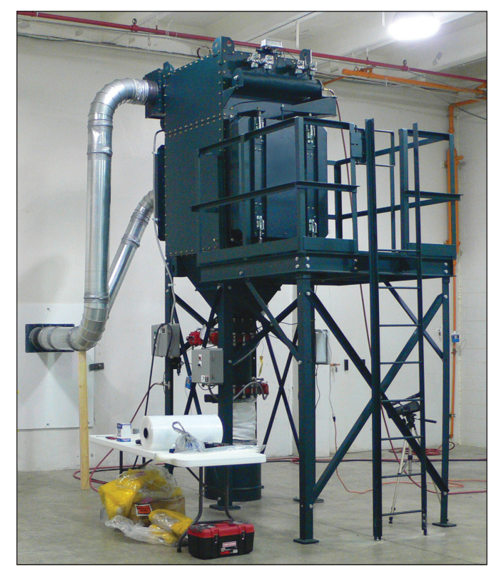
Figure 1. Dust collection equipment used in the surrogate test.

The surrogate testing commissioned by the customer was a Factory Acceptance Test (FAT) to verify performance. It was