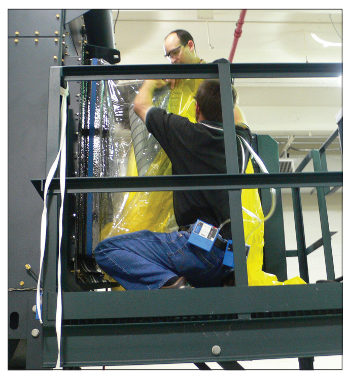
Figure 7. Operators performing BIBO filter cartridge change.

The two operators performed this task, manipulating a total of 16 cartridges during the test period: eight cartridges saturated with lactose and eight new cartridges replaced into the system. To perform filter change-out, the operators opened the hinged access door and worked through the bags to accomplish safe change-out while avoiding direct exposure to the contaminated filters, removing the used cartridges and then installing the new ones - Figure 7 . Each change-out operation