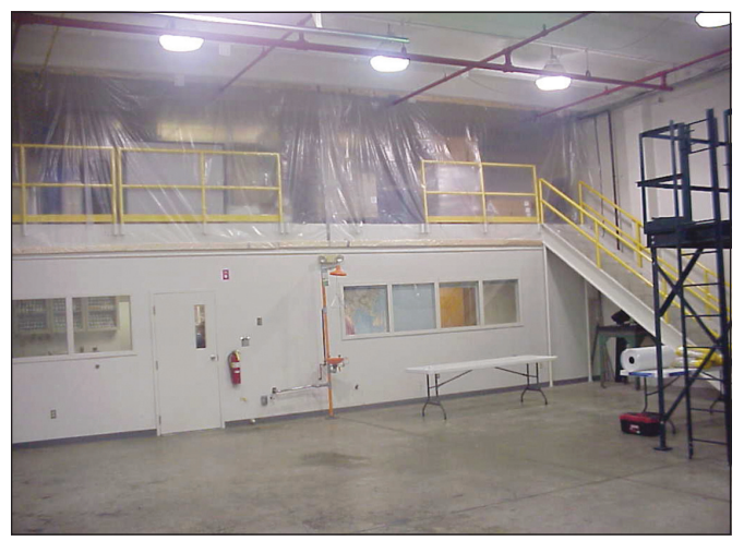
Figure 2. Mezzanine adjacent to test room, sealed off with poly sheeting with dust collector platform visible at the right.