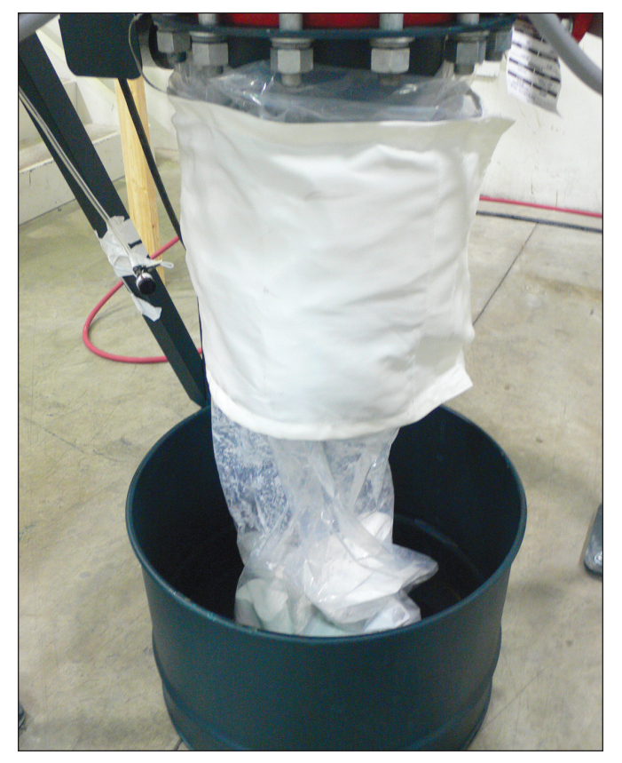
Figure 8. Continuous liner discharge operation.

took approximately 40 minutes to perform, and the operation was completed four times to simulate shift equivalence (206 minutes total).