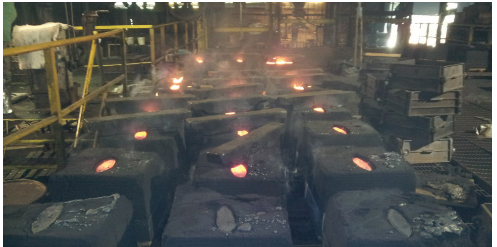
Molten metal is poured into molds made of sand.