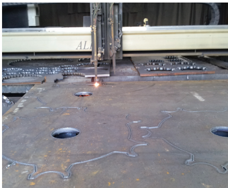
At Brewton, metal undergoes a variety of machining processes.