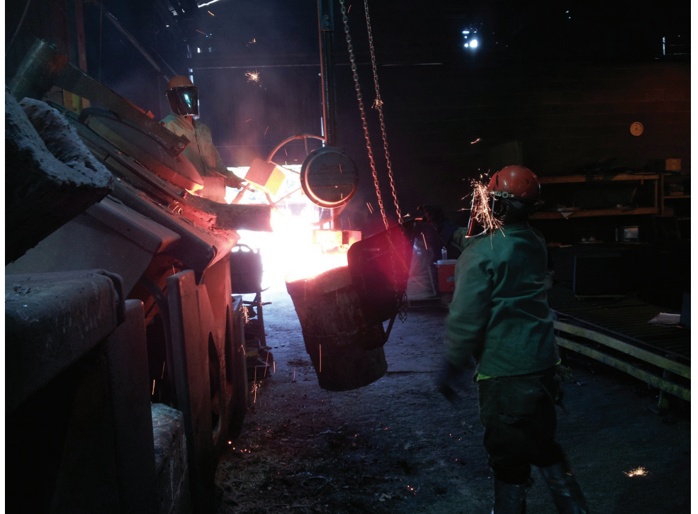
Molten metal is poured into a ladle for transfer.