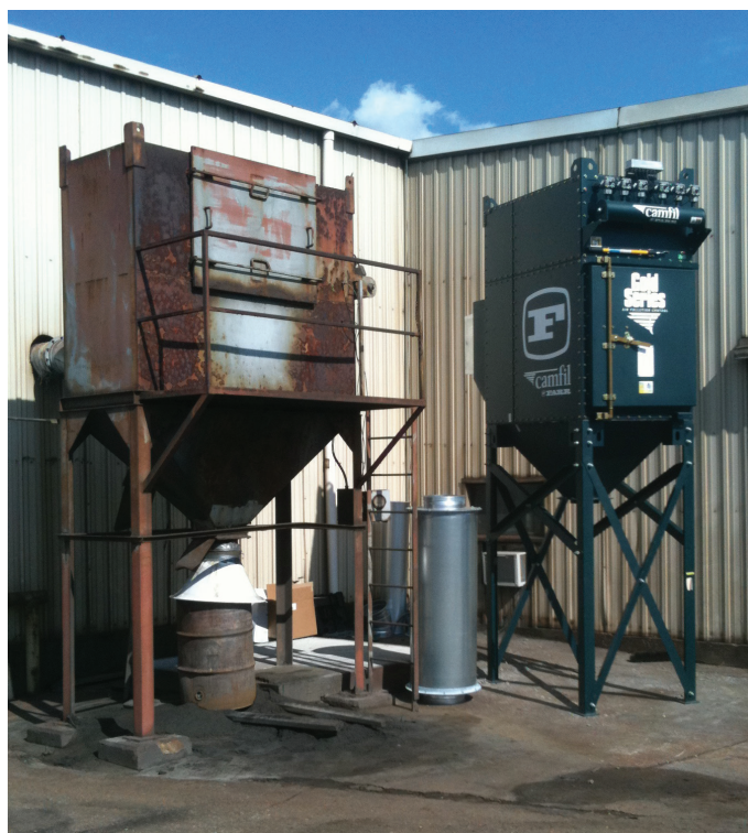
The old, inefficient dust collector with a new Farr Gold Series® unit ready to replace it.

To solve their dust collection problem, Brewton installed a competitor's dust collector, which performed poorly. "It never worked at all. It was terrible," Freas mentioned. "If you don't have a good dust collector inside the shot blasting unit, the sand becomes abrasive and can ruin your entire machine a lot faster than the shot would." This prompted Brewton to look for a better solution.