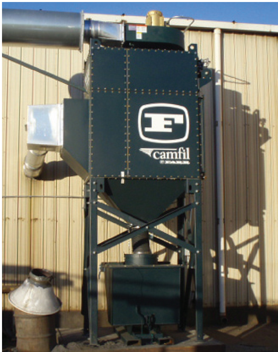
The Farr Gold Series unit, up and running at Brewton Iron Works in Alabama.

For further information regarding this application, contact Southern Environmental Air at (205) 601-5400.