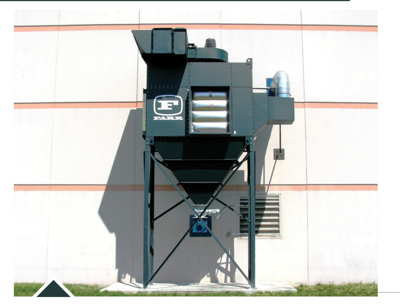
Figure 3. Cartridge dust collector with venting to expel explosion away from building.

If it's not feasible to duct an explosion to the outside through a wall or ceiling in your dust collection application, you'll need an explosion suppression or suppression-isolation system.