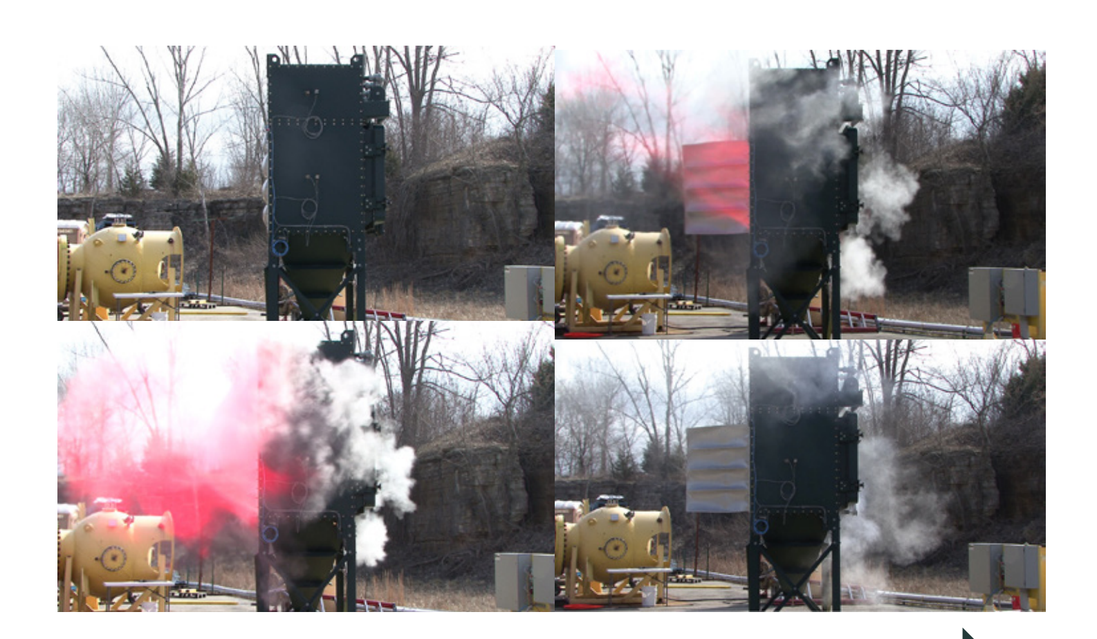
Figure 2a (top left), b (bottom left), c (top right) and d (bottom right). Staged deflagration in a cartridge dust collector with explosion venting.

When you prepare to update existing or install new dust collection equipment, your equipment supplier may ask you to do one of two things: 1) supply in writing the Kst value of your dust, or 2) supply a report of the dust's Kst value based on your dust tests.