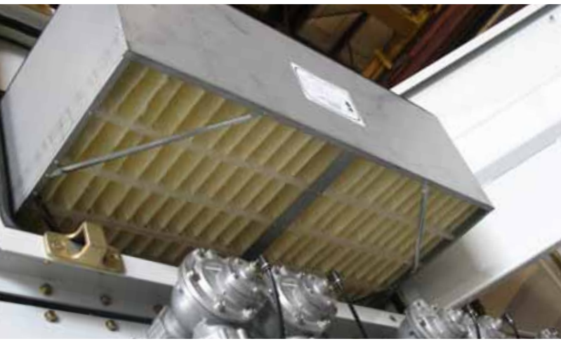
Riga-Flo<sup>®</sup> filter being installed in iSMF.