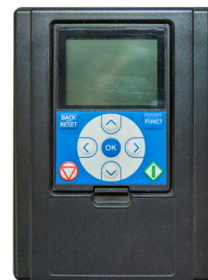
Variable Frequency Drive (VFD)