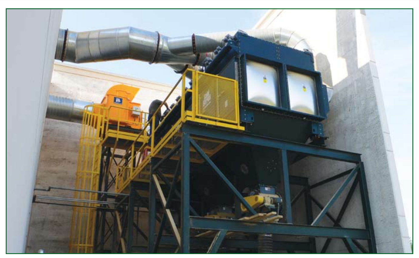
A wall was built to reduce the noise level to a nearby residential area.