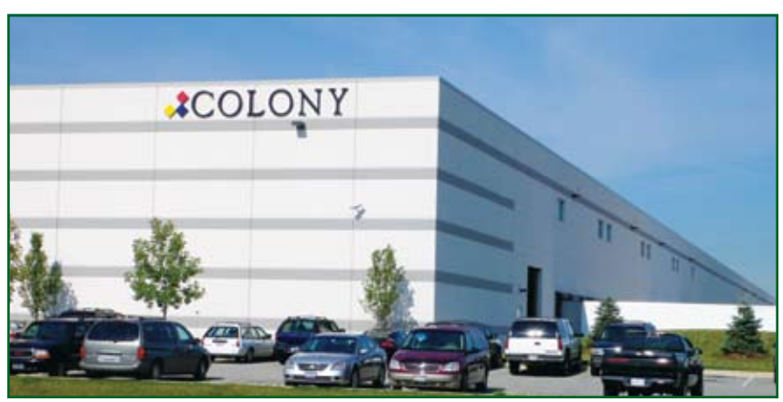
Colony's new 550,000 sq. ft. manufacturing plant.

John says, "The wood dust is being picked up very well from all of the pickup points, the automated saw and router machines!" As of September 2010, the GS48L has been in operation for almost 4 years. The HemiPleat® cartridges were just recently changed out since their original installation back in 2006!