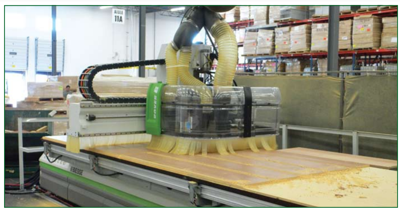
A router exhaust hood is connected to the exhaust system.