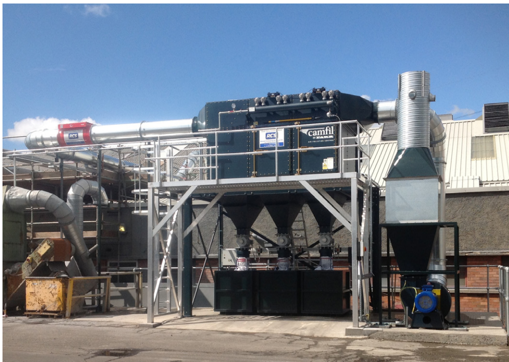
The GS16 is installed outside the factory providing more space, less noise and a cleaner working environment.