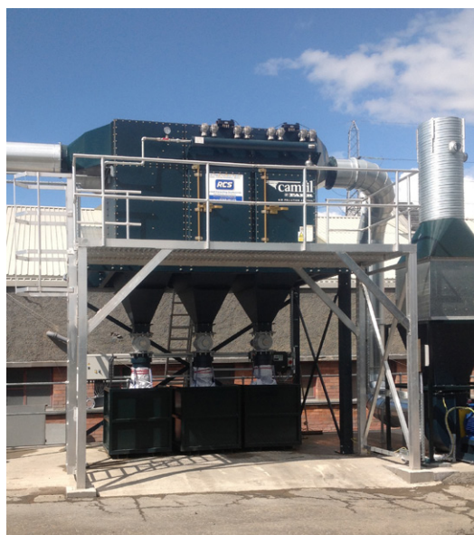
A Farr Gold Series® GS16 located at a global company involved in avionics/automotive industry, Scotland.

This customer was using wet type dust extractors in their manufacturing area to control the dust from their aluminium linishing operations. There were several issues with these wet type dust collectors. They were noisy, inefficient and had to be cleaned out at least once a week. However, most importantly of all they did not comply with the local emissions regulations.