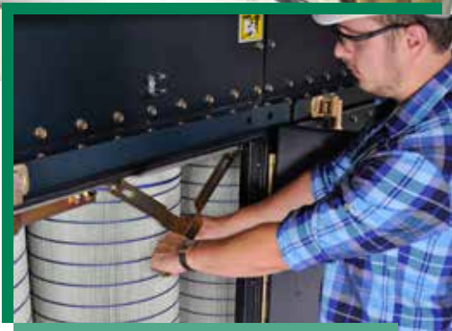
Filter change-out with Farr Gold Series dust collectors is simple and easy.