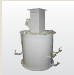
Slurry Tank for Conveying Dust