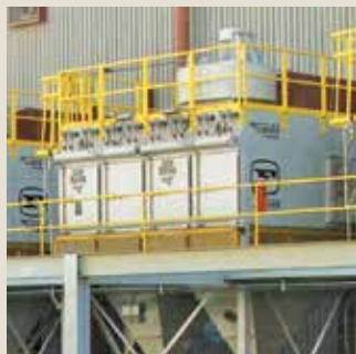
Top Hand Rails