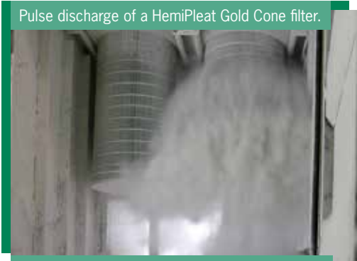
HemiPleat Gold Cone cartridge filters use patented technology design for high efficiency.