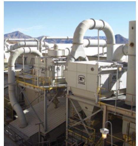
Farr Air Pollution Control system.

In their search for a more efficient way to control dust, management learned of a dry collection system, the Gold Series® dust collector, manufactured by Farr APC and incorporating high efficiency cartridge filters rated at 99.99 percent efficiency on 0.3 micron particles. “The planned retrofit using this system would deliver an estimated emission rate of 0.001 grains/dscf,