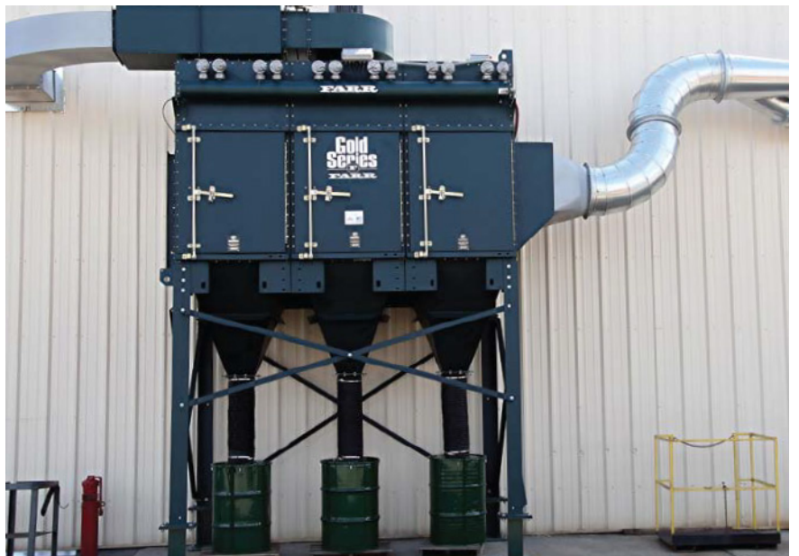
GS24 on laser cutting for carbon and stainless steel

Jeff Pittenger of Effective Controls represented Camfil APC and worked with E&E to develop a dust collection system that would work with excellence and allow for future growth.