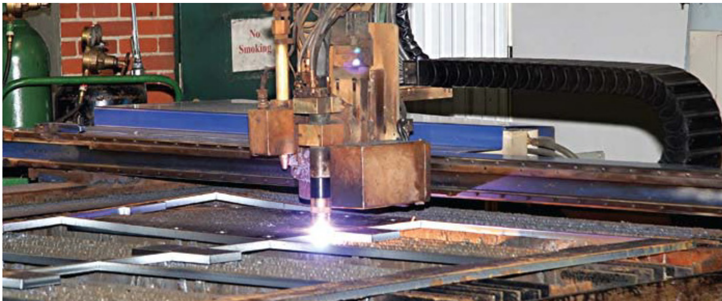
A GS24 was selected for the application, as its capability allowed for expansion.

For further information regarding this application, contact filterman@camfil.com .