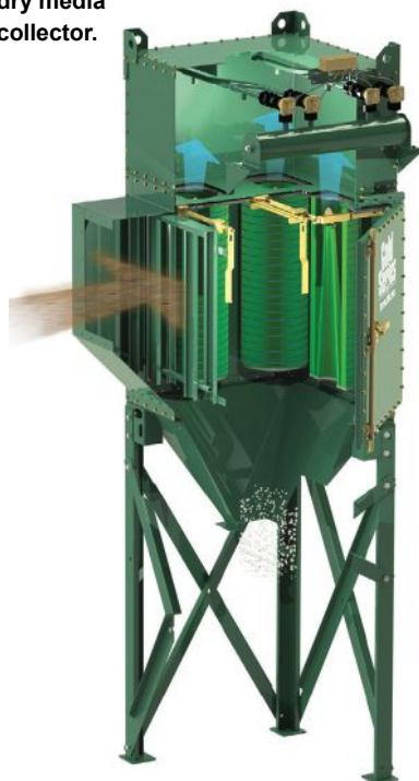
Cutaway of the dry media collector.