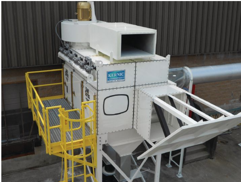
“White collector”: This cartridge collector, also used in a pharmaceutical applications, is equipped with an explosion vent with a vertical upblast-deflector plate.