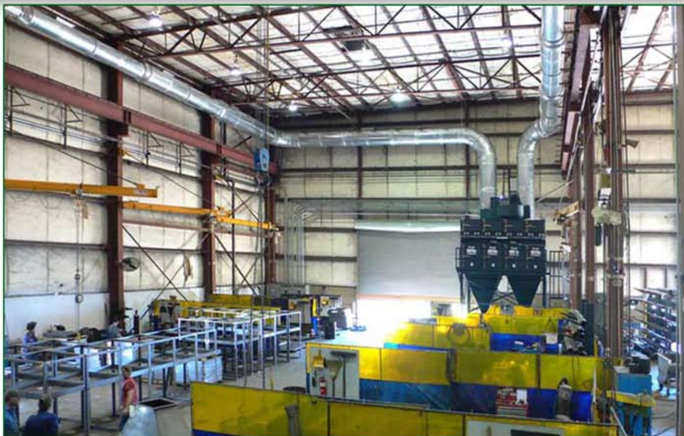
Smoke is collected at the ceiling level by the GS48 and clean air is returned to plant.

The Jonesboro facility of Camfil Farr APC installed an ambient weld fume collector for the welding department several years ago. The system was designed around the Farr Gold Series Collector. The smoke is collected at the ceiling level and clean air is returned back into the plant. You could see how well it cleaned the smoke from the area and the welders loved the new system. It was obvious that the system greatly improved worker conditions and safety but would it pass all the OSHA PEL (permissible exposure limits) for the hazardous materials in the weld fume an respirable dust exposure?