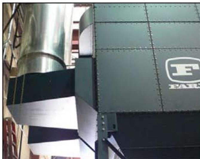
Gold Series right angle inlets

The Jonesboro facility of Camfil Farr APC installed an ambient weld fume collector for the welding department several years ago. The system was designed around the Farr Gold Series Collector. The smoke is collected at the ceiling level and clean air is returned back into the plant. You could see how well it cleaned the smoke from the area and the welders loved the new system. It was obvious that the system greatly improved worker conditions and safety but would it pass all the OSHA PEL (permissible exposure limits) for the hazardous materials in the weld fume an respirable dust exposure?