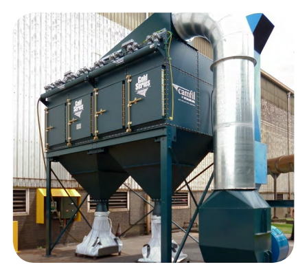
GS32 on blasting at Bisalloy Steel

The main caution is blasting aluminum. Extra safety precautions must be taken like explosion venting and installing the collector outside.