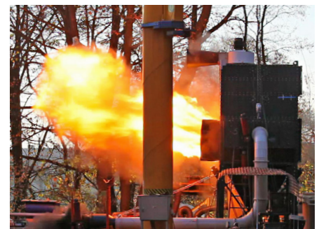
During explosion in a Gold Series, no flames come out of the exhaust pipe. The inlet pipe is protected by a backdraft damper.

Qualified as a Flame Front Arrestor, which describes the passive isolation allowed as prescribed in Chapter 12 of NFPA 69. It also details the test procedure and results of subjecting the Gold Series with iSMF to multiple, controlled and measured internal explosions. This technical report is available upon request.