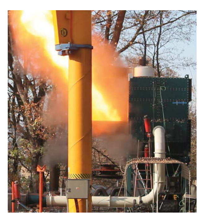
An engineered test is performed at an official testing facility to confirm that this dust collector can withstand an explosive event. Scan QR code to view brief explosion test video.

The collection and testing of dust samples is a long-established practice used by manufacturing professionals to make informed dust collection decisions. While dust testing has always been good practice, it is rapidly becoming a necessity in today's regulatory climate.