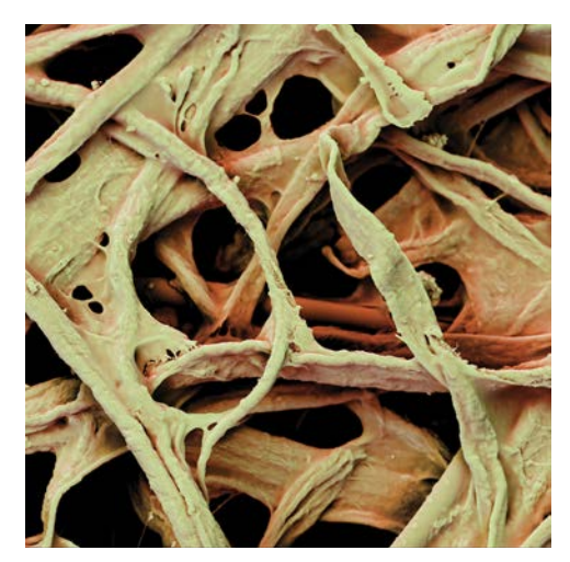
Base media with no coating

To determine whether a dust is combustible, it should undergo separate explosibility testing as stated in NFPA Standard 68. If a dust sample is not available, it is permissible to use an equivalent dust (i.e., same particle size, etc.) in an equivalent application to determine combustibility. But once the dust becomes available, it is still recommended that you go back and test the dust using either the 20-liter test method described in ASTM E1226-12a or the similar method described in ISO 6184/1.