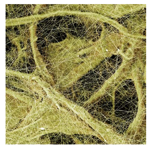
Base media with nano fiber coating