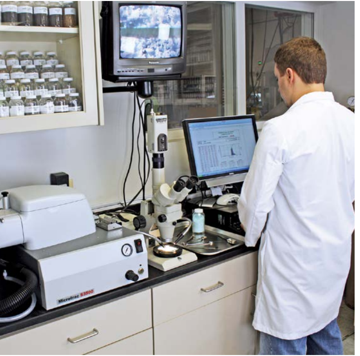
Bench testing identifies physical properties of the dust, aiding filter selection.

Mass density efficiency , defined as the weight per unit volume of air, is the best predictor of a filter's OSHA compliance. For example, OSHA might require that emissions will not exceed 5 milligrams per